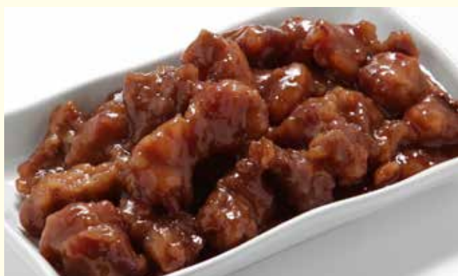
糖醋排骨 Fried Spare Rib with Sweet and Vinegar Sauce