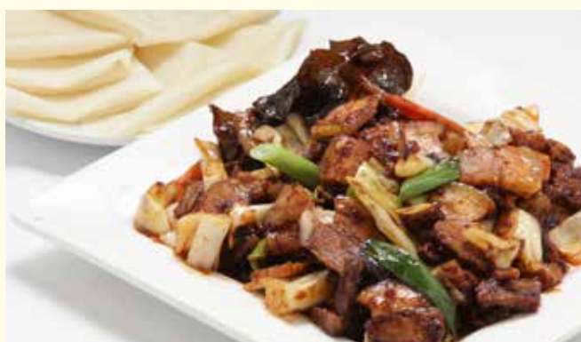
回鍋肉包 Double Cooked Sliced Pork Belly in Chilli Sauce & Wrapped by Steamed Bread