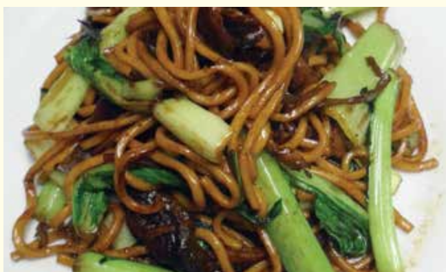
上海粗炒麵 Shanghai Fried Noodle (Pork & Vegetables)