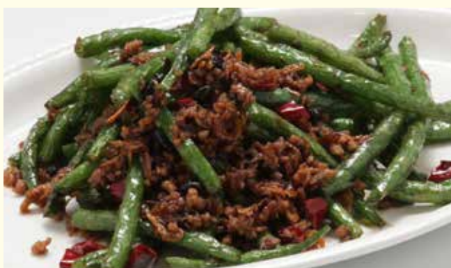
幹煸四季豆 Stir-Fried Green Beans with Minced Pork