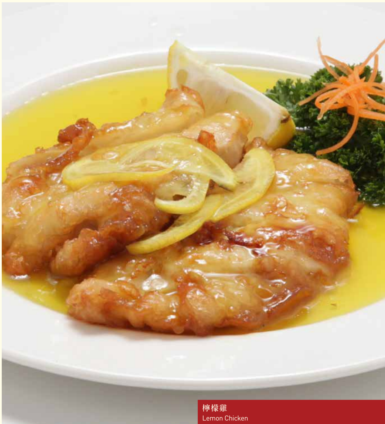
檸檬雞 Lemon Chicken