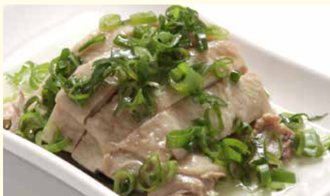
蔥油雞(拆骨) Chicken in Scallion Oil (Boned Off)