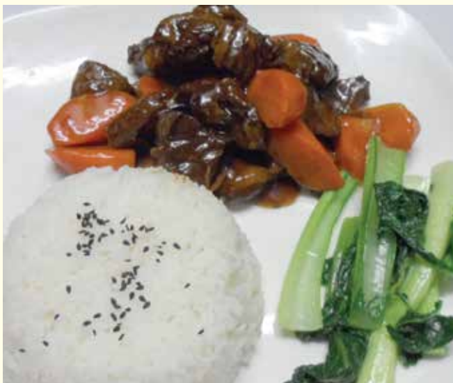
紅燒牛腩飯 Beef Brisket Stew on Rice