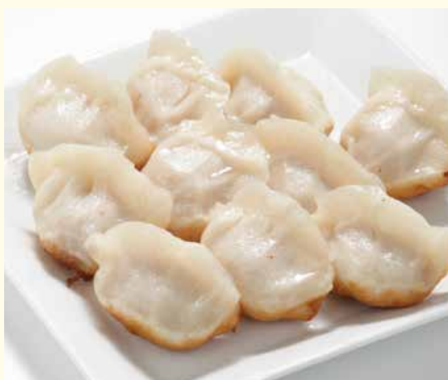
雞蝦鍋貼 Pan-Fried Chicken and Prawn Dumplings