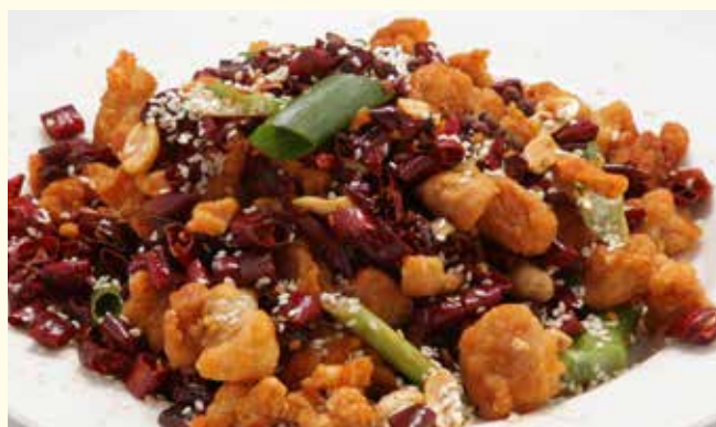
大千辣子雞(拆骨) Deep Fried Chicken with Hot Chilli (Boned off) (Szechuan)