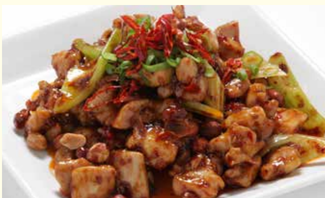
宮保雞丁 KUNG PO Chicken