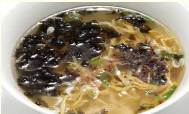
上海千里香小餛飩 Shanghai Traditional Mini Wonton Soup