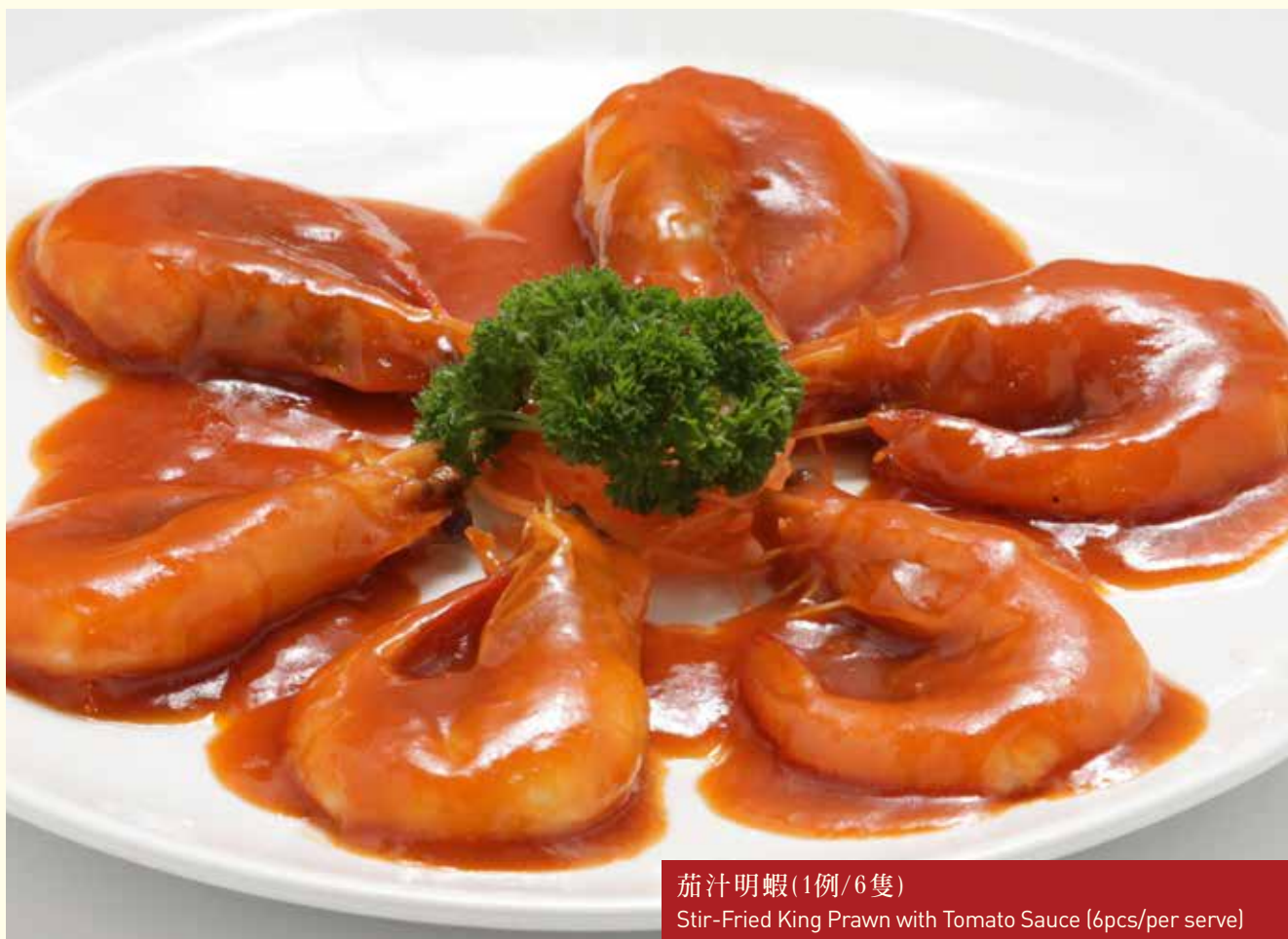
茄汁明蝦(1例/6隻) Stir-Fried King Prawn with Tomato Sauce (6pcs/per serve)