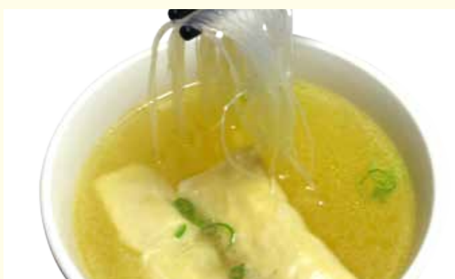
百葉包粉絲湯 Bean Curd Skin Roll and Vermicelli Soup