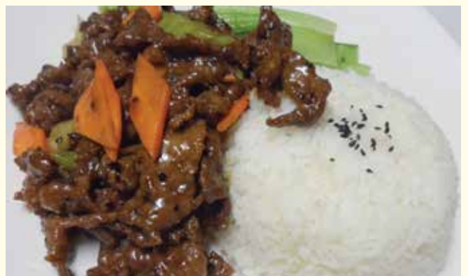
黑椒牛肉飯(現炒) Sliced Beef with Black Pepper on Rice