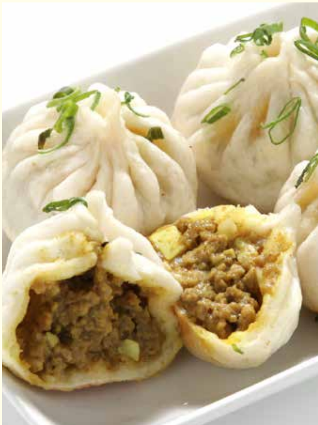
特色牛肉生煎包(咖喱) Pan-Fried Beef Mini Buns (Curry)