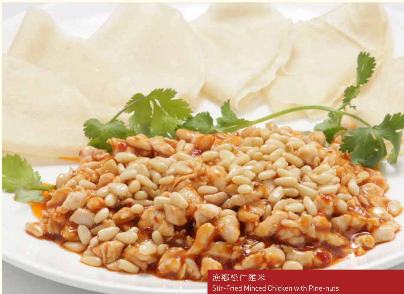
漁鄉松仁雞米 Stir-Fried Minced Chicken with Pine-nuts