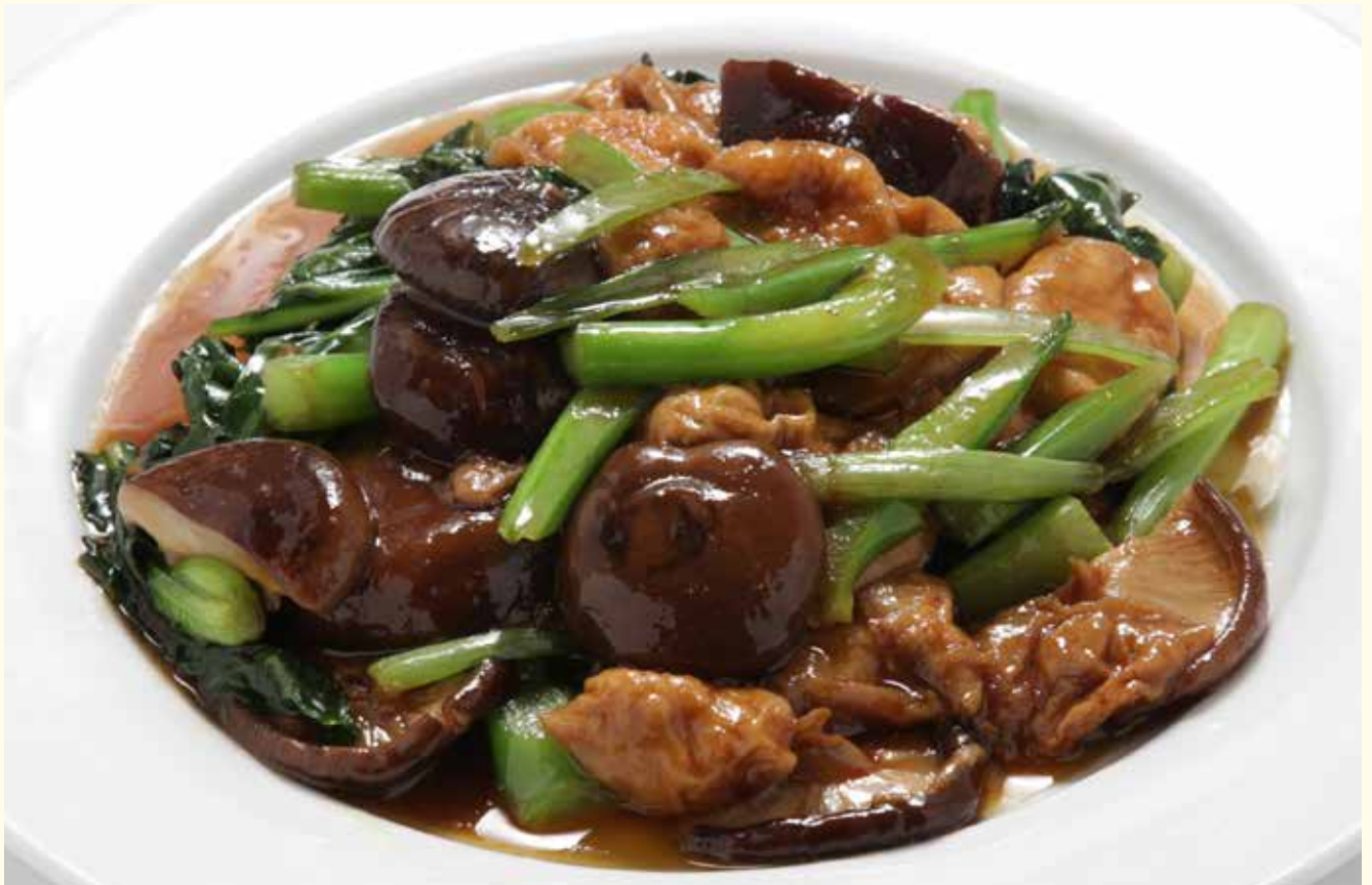
菜心香菇炒麵筋煲 Stir-Fried Choy Sum with Gluten Puff and Mushroom