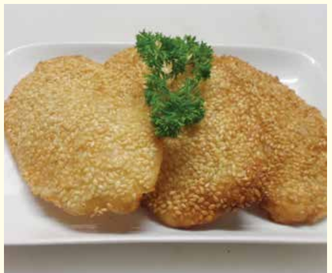
蟹殼黃/鹹 Homemade Golden Sesame Cake