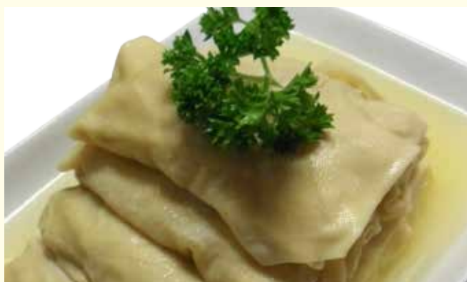
上海雞汁百葉包 Bean Curd Skin Roll in Chicken Stock (Minced Pork & Prawn)