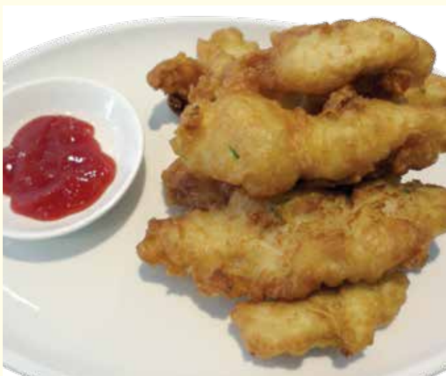
椒鹽魚排 Deep Fried Fish Schnitzel with Salt & Pepper