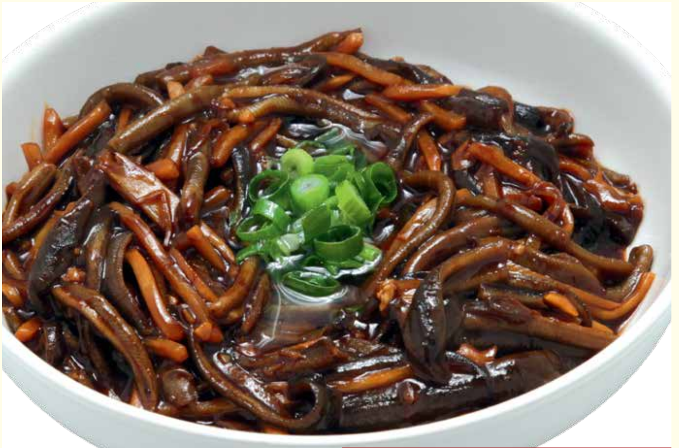
上海響油鱖絲 Stir-Fried Shredded Eel in Sweet and Soya Sauce