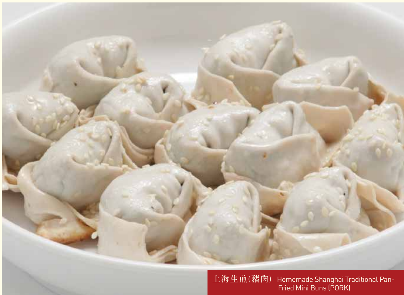
上海生煎(猪肉) Homemade Shanghai Traditional Pan-Fried Mini Buns (PORK)