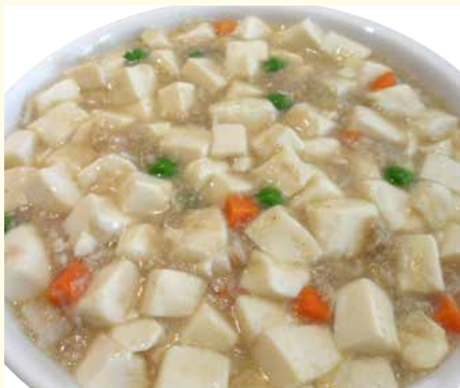
蟹粉豆腐 Bean Curd with Crab Meat