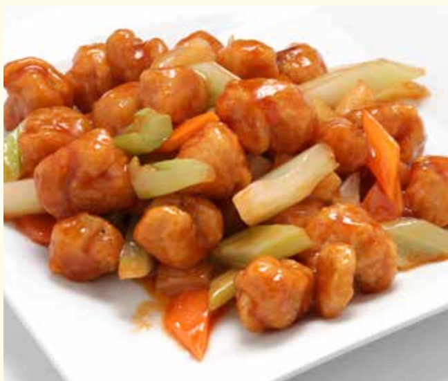
咕嚕雞 Sweet and Sour Chicken