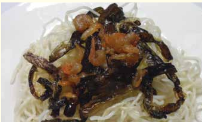
上海蔥油拌面/開洋(送湯) Mixed Noodle with Scallion Oil (Comes with 1 Free Soup)