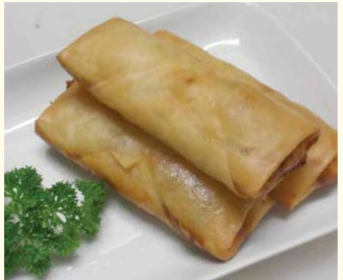
炸春卷 Spring Rolls (Pork & Vegetables)