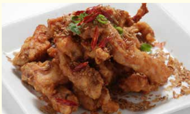
椒鹽排條 Deep Fried Crispy Pork Ribs