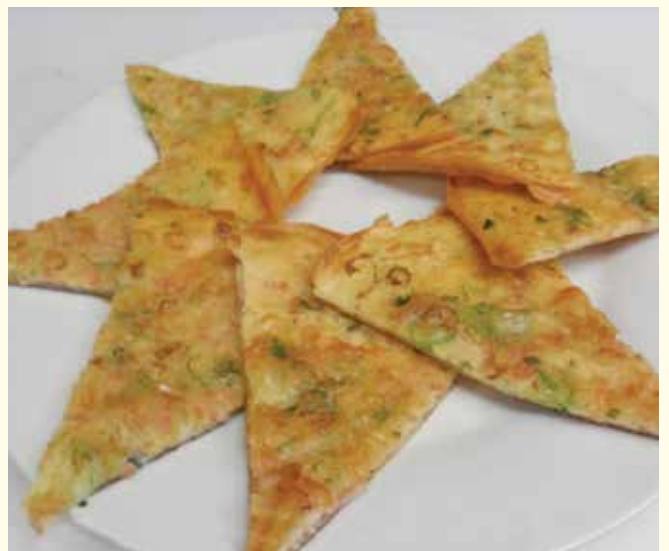
特色蔥油餅(或素) Homemade Spring Onion Pancake (With Bacon / Vegetarian)