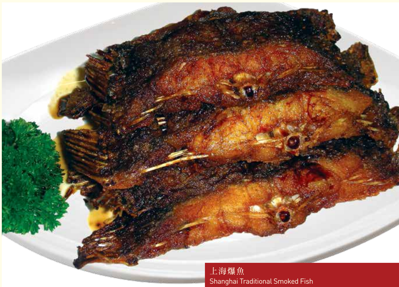
上海爆魚 Shanghai Traditional Smoked Fish