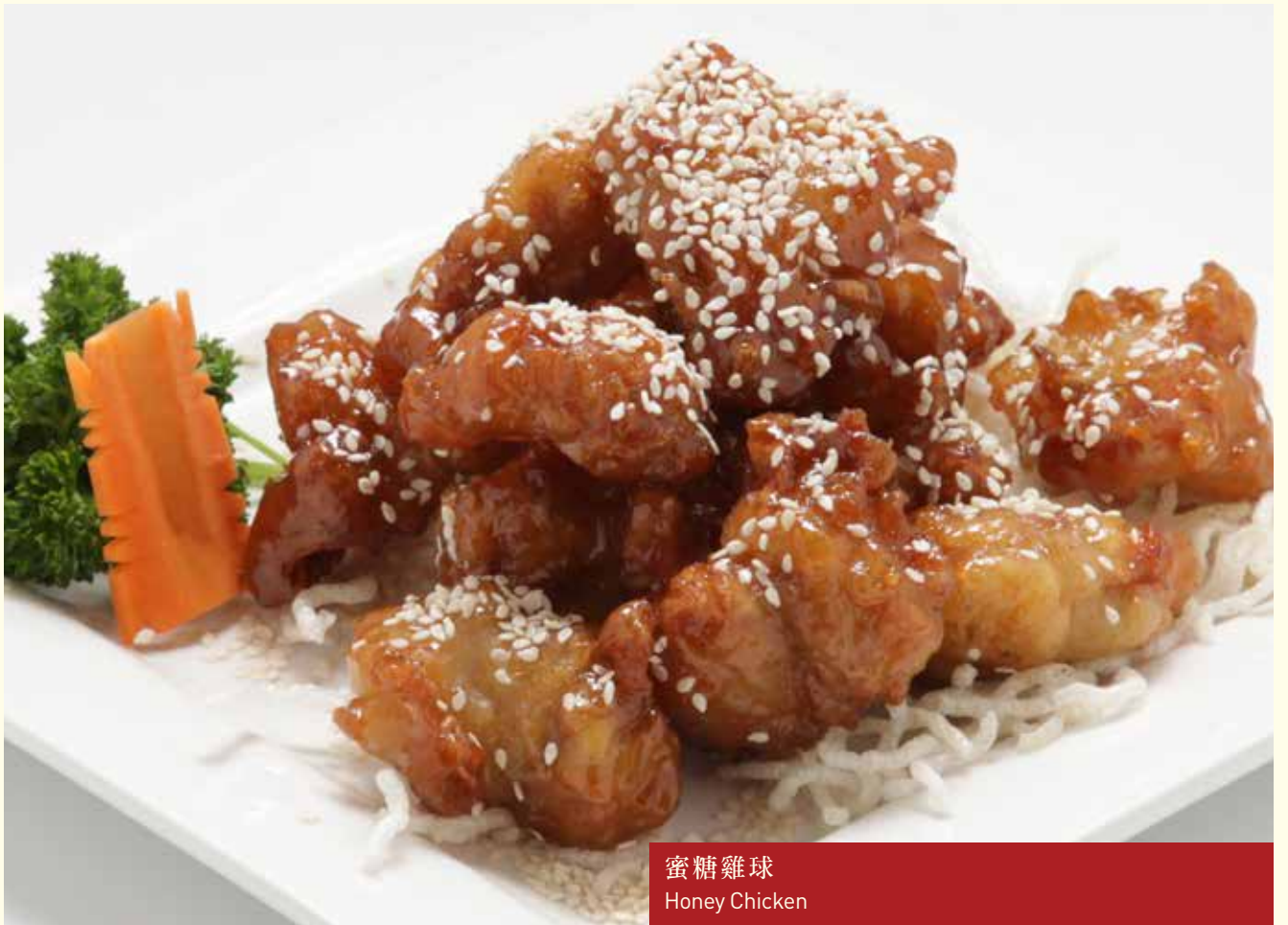
蜜糖雞球 Honey Chicken