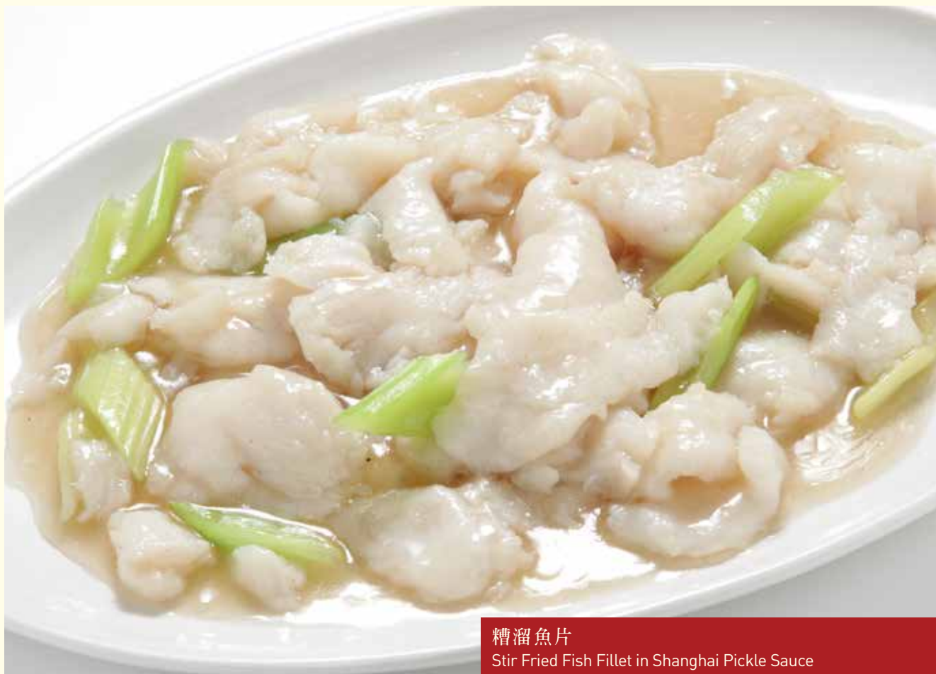
糟溜魚片 Stir Fried Fish Fillet in Shanghai Pickle Sauce