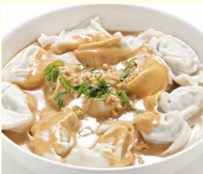
上海菜肉耳光餛飩(麻醬) Pork, Prawn & Veggie Wontons (Peanut & Sesame Butter Sauce)