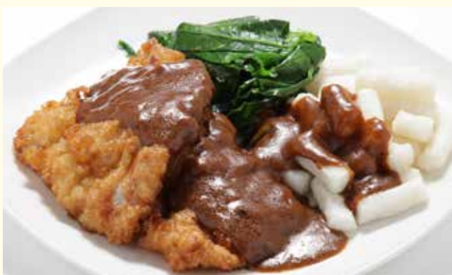
上海排骨年糕 Pork Chops with Rice Cake