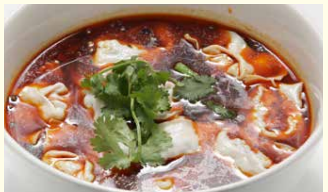
麻辣鮮餛飩(魚餡) Spicy Wontons Soup (Minced Fish)