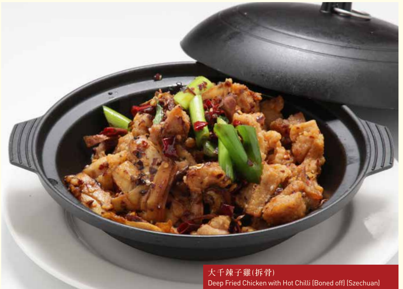
大千辣子雞(拆骨) Deep Fried Chicken with Hot Chilli (Boned off) (Szechuan)