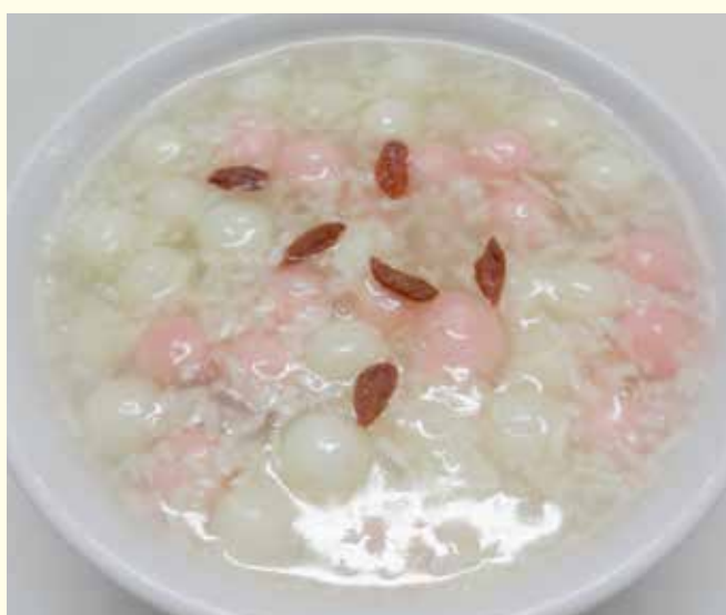
上海酒釀圓子 Glutinous Rice Balls in Sweet Rice Wine