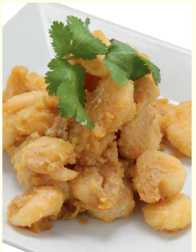
鹹蛋黃蝦仁 Stir-Fried Shelled Shrimps with Salted Egg Yolk