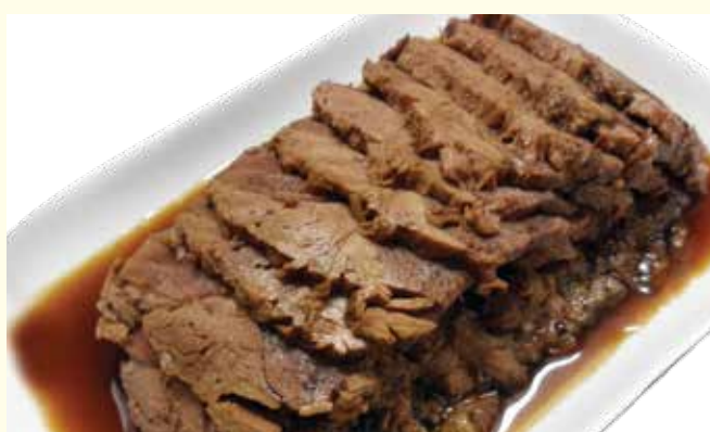
五香牛肉 Five Spice Beef