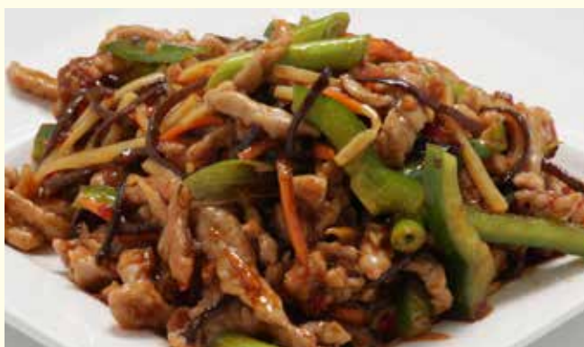
漁鄉肉絲 Sliced Bamboo Shoots & Shredded Pork with Chilli & Sour Sauce