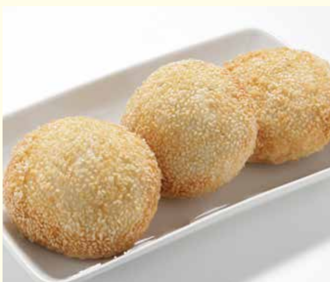
黃金小麻餅(豆沙) Golden Sesame Cake (Red Bean)