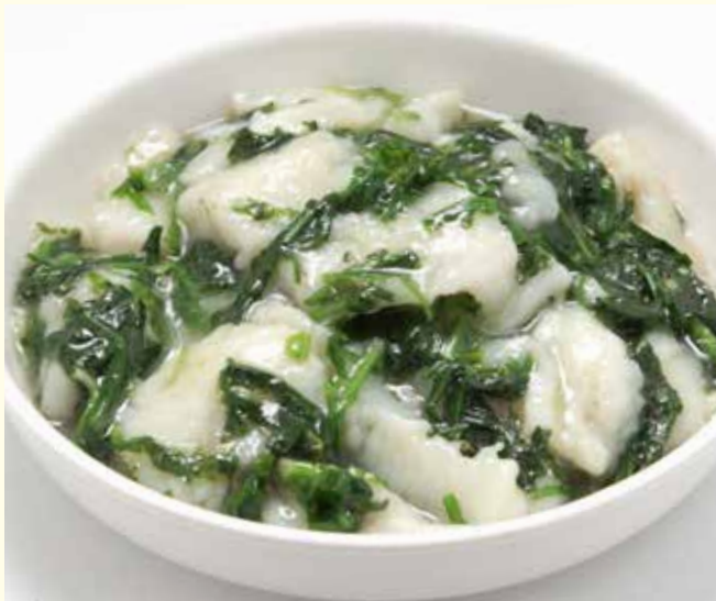
薺菜魚片 Stir-Fried Fish Fillets with Chinese Spinach